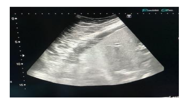
Liver steatosis and perihepatic fat Ultrasound